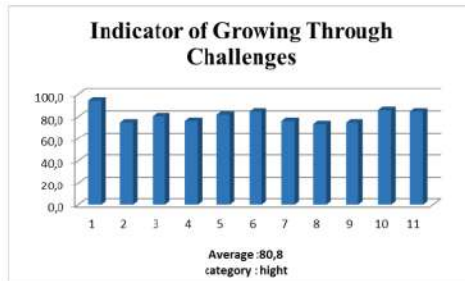
Figure 2. Indicator Through Challenges

Based on the table of indicators developing through the challenges above, there are a total of 640, a max value of 68 and a min value of 53, and a standard deviation of 2,093. With a percentage of 80.8% in the high category.