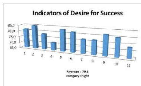
Figure 5. Indicators of Wanting to Succeed

Based on the table of indicators for success above, there are a total of 560, a max value of 51 and a min value of 43, and a standard deviation of 5,851. With an average percentage of 79.1% in the high category. The overall result of the mental toughness level of Karyamukti