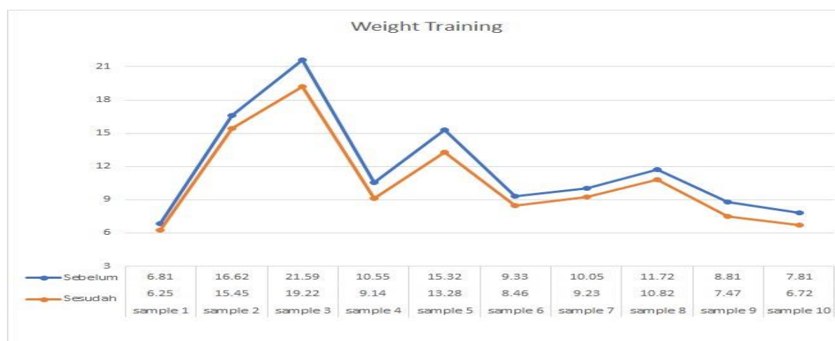
Figure 2. Comparison before and after weight training

Based Figure 2 Physiologically, the athlete's increased speed can be attributed to increased muscle strength, endurance, and movement efficiency that are direct results of weight training. Lower body exercises, such as squats and calf raises, strengthen the leg muscles for faster acceleration during the initial push-off. Upper body training, such as pull-ups and bench presses, increases grip strength and body pulling power, which are essential for maximizing body transfer from one grip to another. In addition, full body training supports stability, coordination, and injury prevention, which are important factors in supporting optimal performance ( Suharjana, 2018 ).